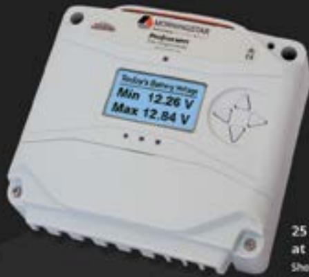
25 or 40 amp versions at up to 120 VOC Shown with optional meter

The ProStar MPPT solar controller is an advanced maximum power point tracking (MPPT) battery charger for off-grid photovoltaic (PV) systems with PV array max power (Pmp) up to 1400 watts. All versions have TrakStar™ Technology and include load control. The controller allows multiple modules in series for 12V and 24V battery systems. Detailed battery programming options allow for advanced battery support for the latest Lithium, Nickel Cadmium, and Lead Acid battery types.